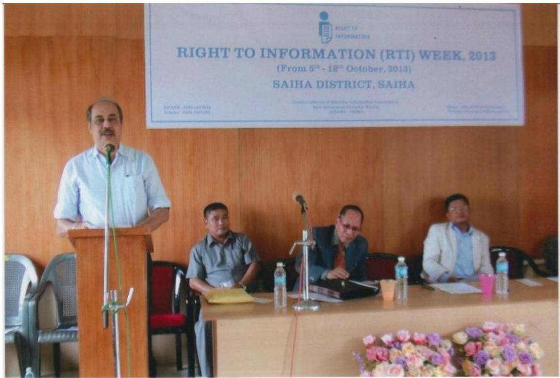
Observance of RTI Week, 2013 at Saiha District