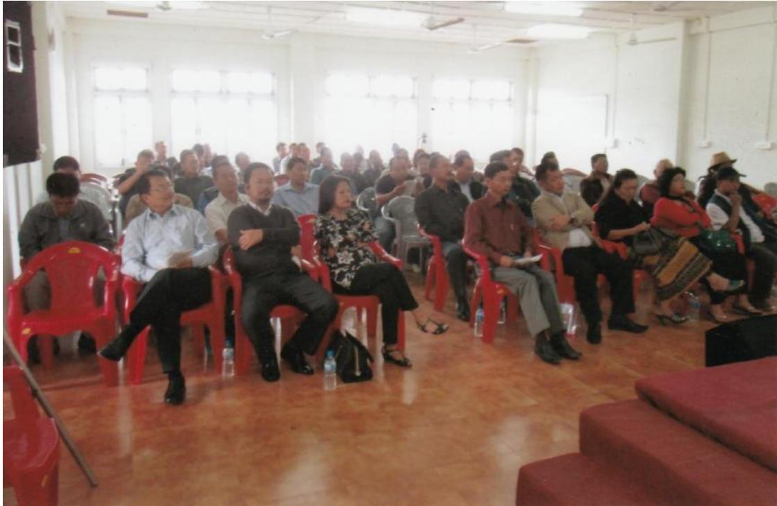
Participants at the RTI Week 2013 function at Lunglei