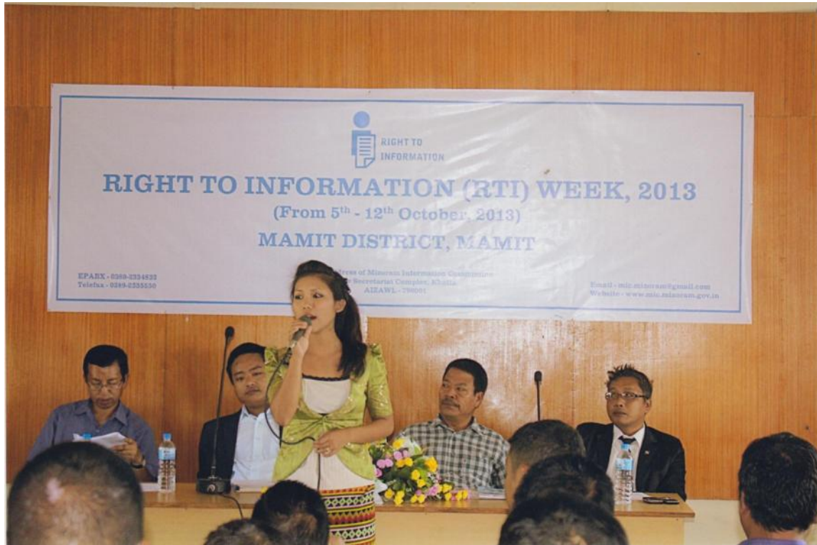
Observance of RTI Week, 2013 at Mamit District