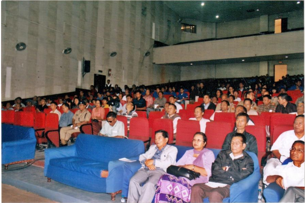
Participants at the RTI Week 2013 function at Vanapa Hall, Aizawl