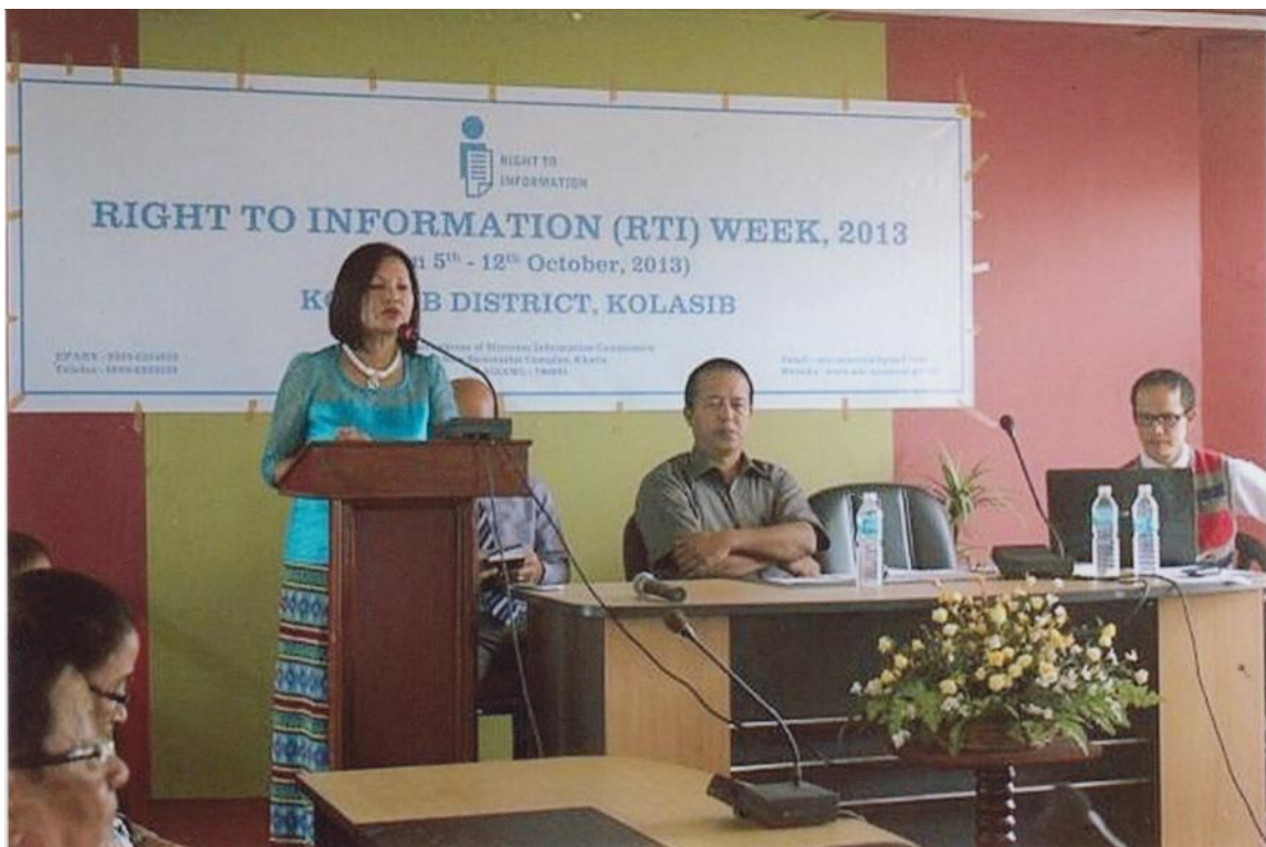
Observance of RTI Week, 2013 at Kolasib District