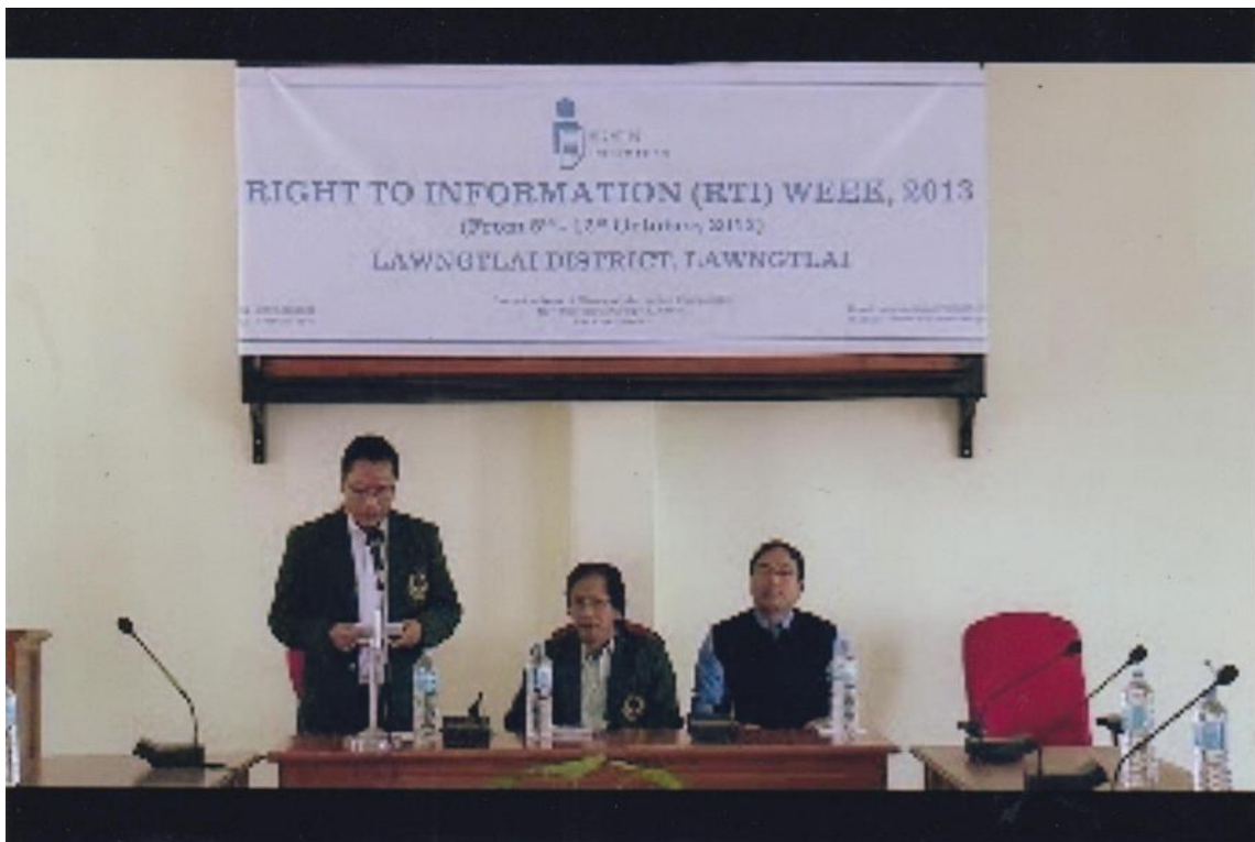
Observance of RTI Week, 2013 at Lawngtlai District