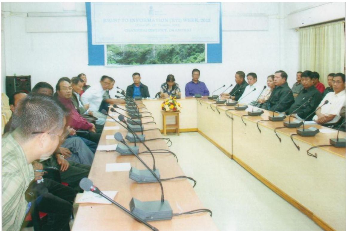
Observance of RTI Week, 2013 at Champhai District