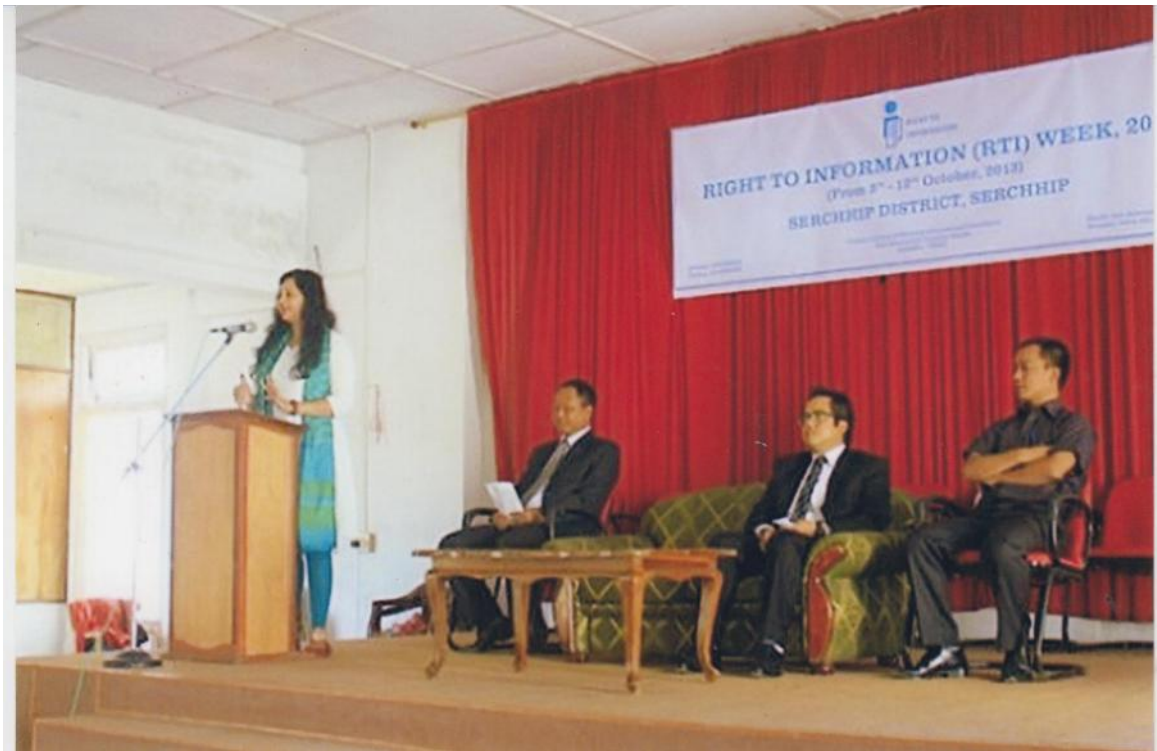
Observance of RTI Week, 2013 at Serchhip District