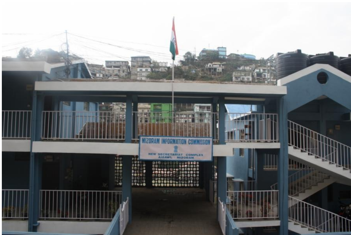
Mizoram Information Commission's Building located at the beginning of New Secretariat Complex, Khatla